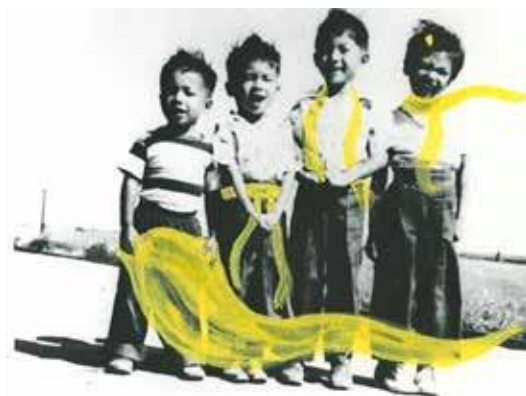
Raeann Kit-Yee Cheung Dual Identity , 2021 Inkjet on archival paper