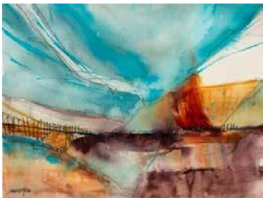
Angela Fehr Does It Begin Where It Ends, 2022 Watercolour and graphite Collection of the artist

How can an artwork capture the dynamic experience of space? What does the smell of rain look like in a painting? Or our dream experiences in relationship to our waking experiences? Even in a moment when the landscape appears still, there is tons of activity happening that cannot be captured in a single frame—from the intricate and complex patterns of weather and climate to the buzzing of cellular exchanges on a micro level. The landscape is alive and fluctuating—and so is our own journey through it. As we move through the world, we experience a wonderful abundance of senses, thoughts, and feelings as our bodies respond to, absorb, and contribute to our surroundings. For millennia, artists have imaginatively worked to translate these embodied experiences, including phenomena that extend beyond the visual senses like smell, touch, emotion, spirituality, sound, and time. Balancing between abstract marking and painterly realism, Touching the Sky features three Peace Region artists whose work is rooted in exploring these embodied experiences and our ability to represent them through art.