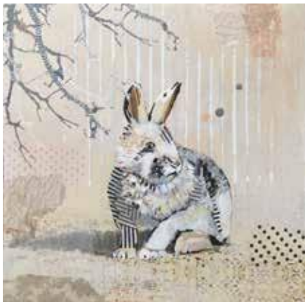
Samantha Walrod Waiting Rabbit - Dots & Stripes, 2023 Mixed media and acrylic on panel