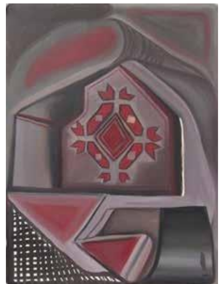
Hanny Al Khoury Pal 4, 2022 Oil on paper Collection of the artist TRES Exhibition: Cradle