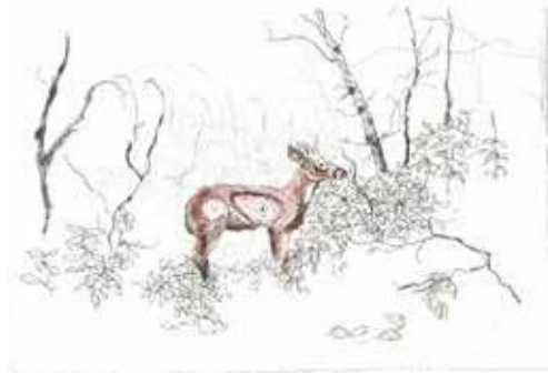
Kiona Callihoo Lighvoet It Only Punctured Foam, 2022 Mixed media on paper Collection of the artist

The artworks in What's Held explore ways of memorializing, mapping, and holding onto these significant sites, keeping our stories of them alive and present, even as the landscape shifts or carries us further away from home. Beyond settler borders and monuments, the works recognize the power and importance of place; from the desire paths left over from continually wandering the same treasured areas in meadows, fields, and forests, to the objects and scents that come to represent the ways that we've known these spots across landscapes.