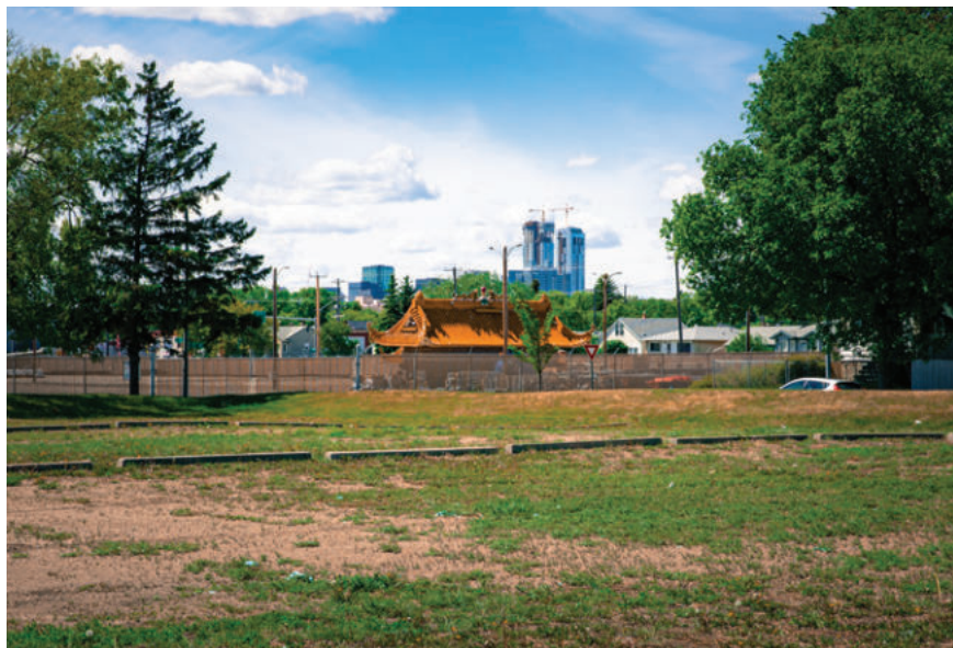
Harbin Gate in storage, June 5, 2018.