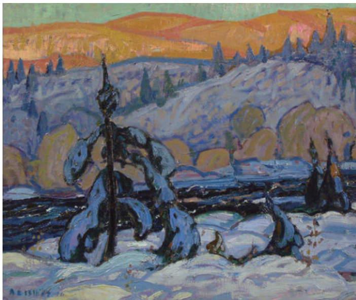
Arthur Lismer, Winter , 1920, oil on linen. Art Gallery of Alberta Collection. Gift of The Ernest E. Poole Foundation, 1975.