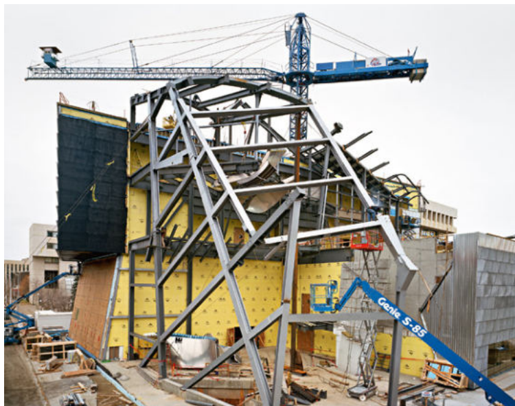
Edward Burtynsky, Structural Steel Phase 20: Looking North East , November 2008, Art Gallery of Alberta, 2008, digital chromogenic colour print. Edition 1 of 6. Art Gallery of Alberta Collection. Gift of Edward Burtynsky, 2011.