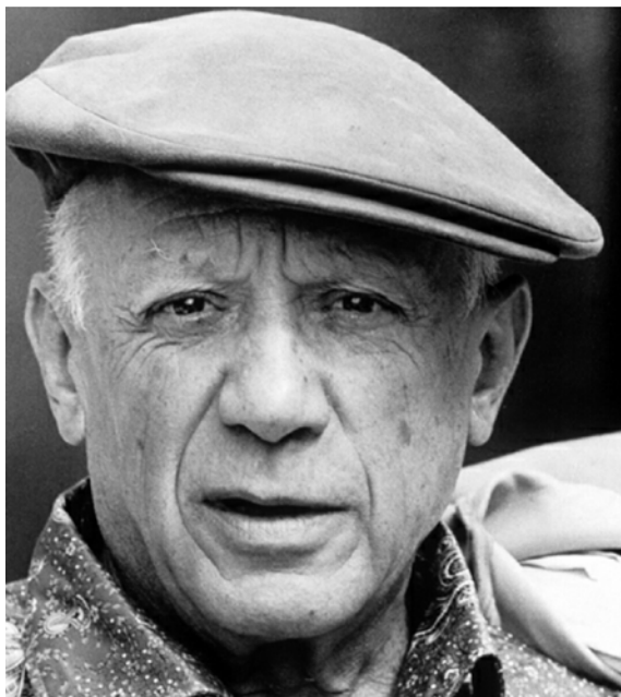
Pablo Picasso. © Picasso Estate / SOCAN (2020)