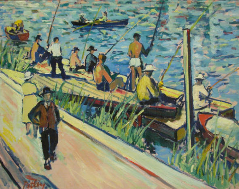
Llewellyn Petley-Jones, The Anglers , c. 1948. Oil on linen. Collection of the Art Gallery of Alberta, purchased 1950.