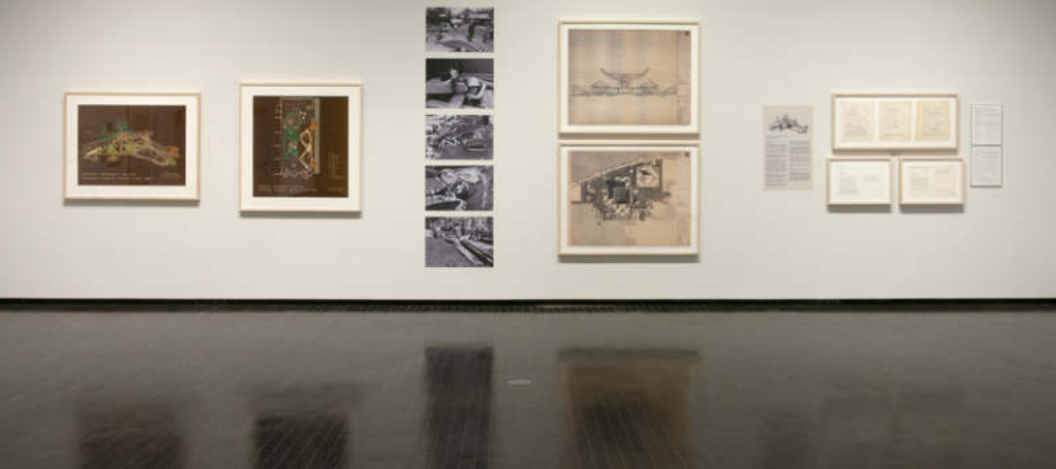
Cornelia Hahn Oberlander: Genius Loci, 2021.