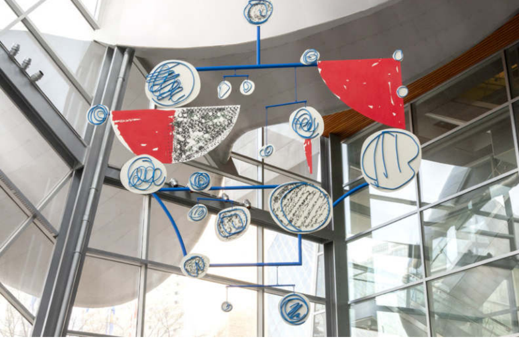
Damian Moppett, Untitled Abstract Drawing in Space , 2020. Stainless steel, aluminum plate, copper pipe and enamel. Produced with funds from an Alberta Foundation for the Arts Public Art Commissioning grant program.