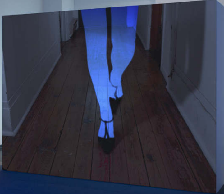
Anna Hawkins, Blue Light Blue , 2021. 4k Video and 16mm transferred to 4k.