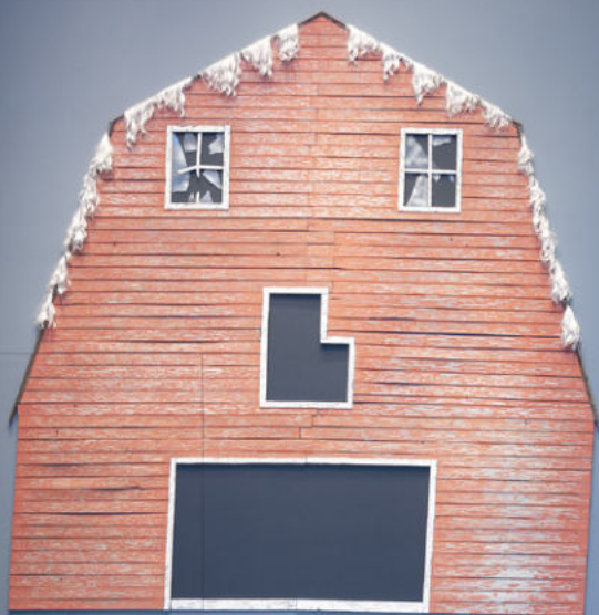
Jude Griebel, Barn Skull , 2019, 200”h x 192”x 6”, wood, acrylic paint, synthetic hair.