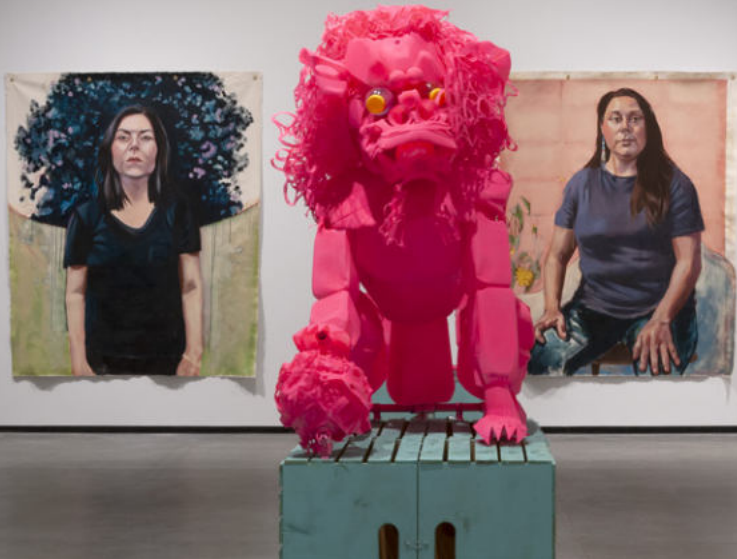
Left to right: Lauren Crazybull, Coty , 2020, acrylic on canvas; Yong Fei Guan, 塑胶狮 Sujiao Shi , 2018, household plastic waste, pvc pipe, screws, nails and wood; Lauren Crazybull, Kristen , 2020, acrylic on canvas. Installation view of The Scene , Art Gallery of Alberta, Edmonton, 2021. Courtesy of the Artists. Photo: Art Gallery of Alberta.