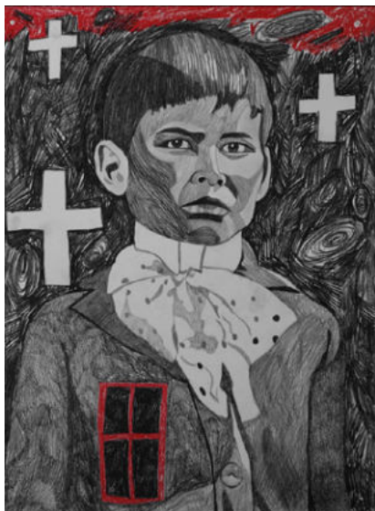
George Littlechild, Photo: Unidentified Child From The Ermineskin Indian Residential School #3 , 2019. Mixed Media on Paper, 30”h x 22”w. Courtesy of the Artist. This work was supported by the British Columbia Arts Council.