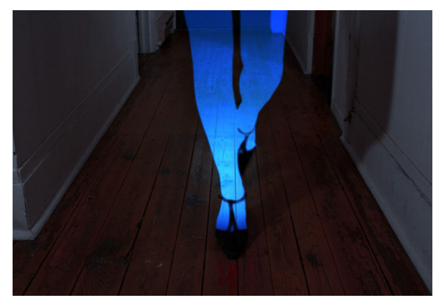
Anna Hawkins, Blue Light Blue (still), 2020.