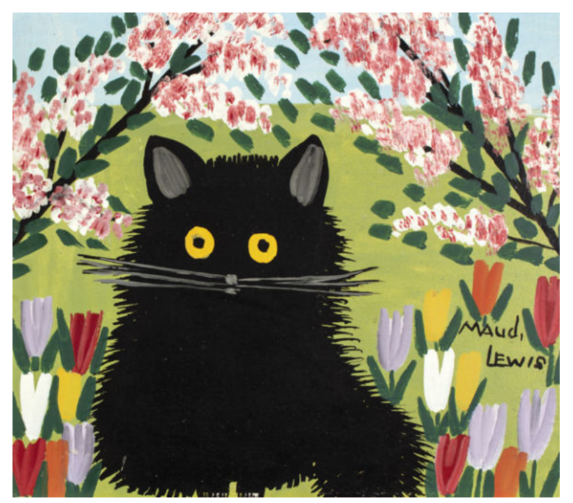
Maud Lewis, Untitled (Black Cat with Tulips and Apple Blossoms) (detail), c. 1962. Oil on board.