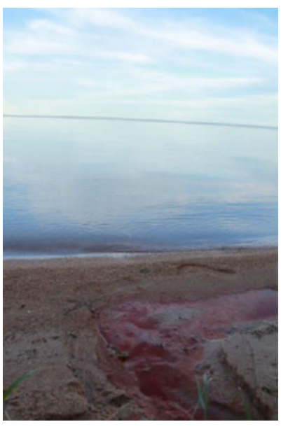
Tanya Harnett, Cold Lake First nation: Damaged Spring at Blueberry Point, 2011. Art Gallery of Alberta Collection, purchased with funds from the Canada Council for the Arts New Chapter Grant Program.

Water-Wise, River Breath: Reframing Design's Role