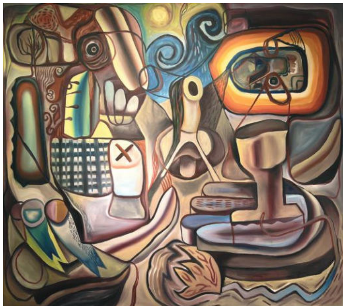
Hanny Al Khoury, Revenge , 2022. Oil on canvas.