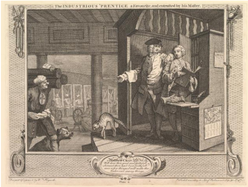
William Hogarth, Industry and Idleness , plate 4, 1747. Etching and engraving.