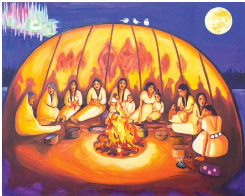
Lana Whiskeyjack, Niskipisim - Goose Moon , 2021, oil on board. Courtesy of the Artist and Whiskeyjack Art House.