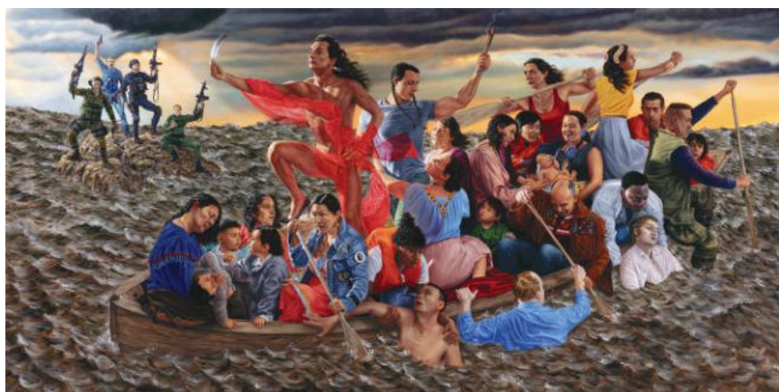
Kent Monkman, Study for "mistikôsiwak (Wooden Boat People): Resurgence of the People," (Final Variation) , 2019. Acrylic on canvas. Collection of the Sobeys Art Foundation