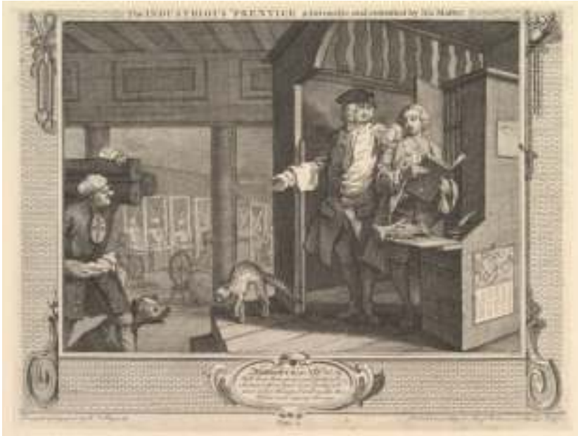
William Hogarth, Industry and Idleness , plate 4, 1747. Etching and engraving.