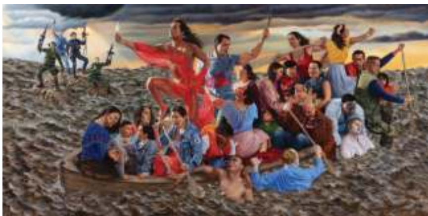
Kent Monkman, Study for "mistikôsiwak (Wooden Boat People): Resurgence of the People," (Final Variation) , 2019. Acrylic on canvas. Collection of the Sobeys Art Foundation