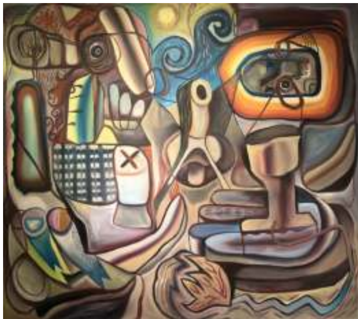
Hanny Al Khoury, Revenge , 2022. Oil on canvas.