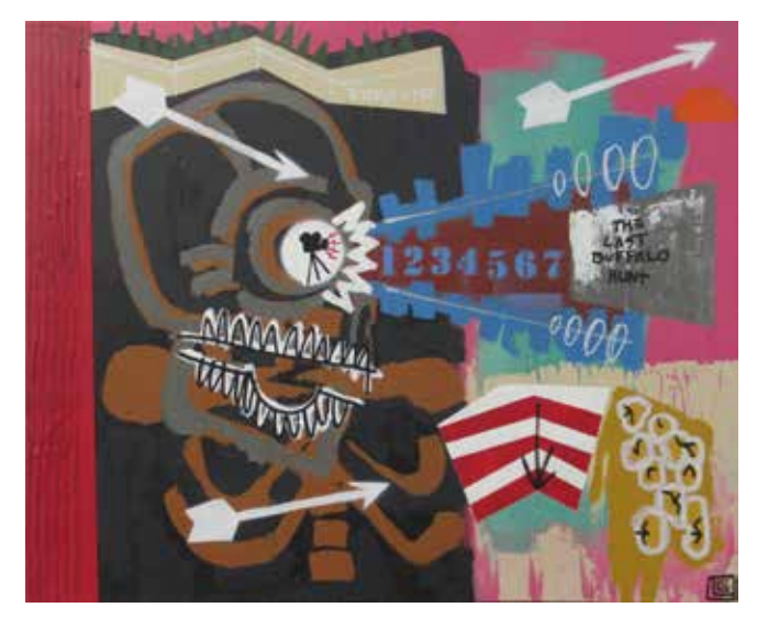
Lonigan Gilbert The Last Buffalo Hunt, 2020 Acrylic, spray paint on canvas Collection of the artist