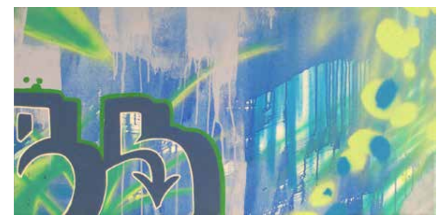
Matthew Cardinal Expression, 2022 Acrylic and house paint on canvas Collection of the artist