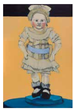
Riki Kuropatwa Not Your Doll, 2019 Acrylic on wood panel Collection of the artist

A second exhibition which begins travelling TREX Region 2 in September is entitled Figure It Out. For over 40,000 years the human figure has been a vital subject in humanity's artistic endeavors. Often focusing on history, mythology, allegory or the imagination, most cultures on earth have recorded depictions of the human figure while in the visual arts produced in Alberta the human figure has become one of the most prominent expressions among contemporary artists.