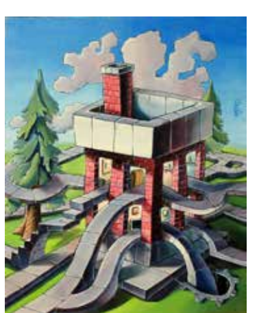
Byron McBride Home Delivery, 2021 Acrylic on panel Collection of the artist

The exhibition Figure it Out will travel Alberta from September 2022 to September 2024.