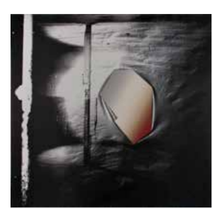
Walter Jule Untitled: From the Killing Room Series, 1977 Screenprint, lithograph on paper Collection of the Alberta Foundation for the Arts TREX Region 2 Exhibition: 40 is the new 20!