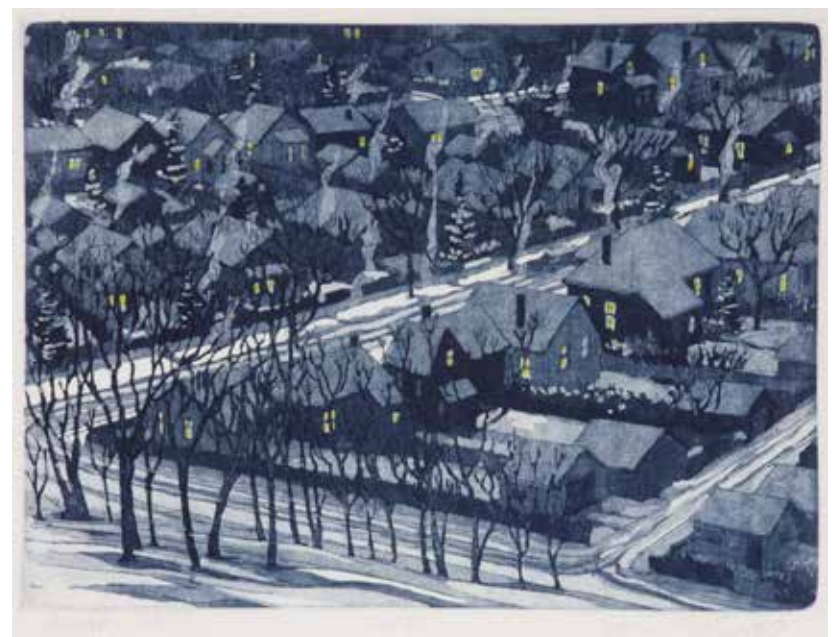
Stan Phelps Winter Still, 1987 Coloured etching on paper Collection of the Alberta Foundation for the Arts