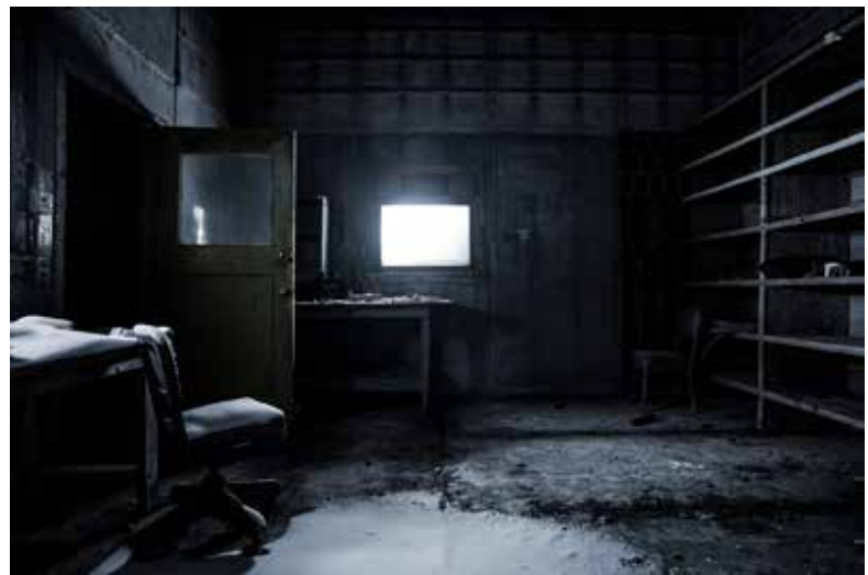
aAron Munson Isachsen 07 , 2018 Photographic print Collection of the artist