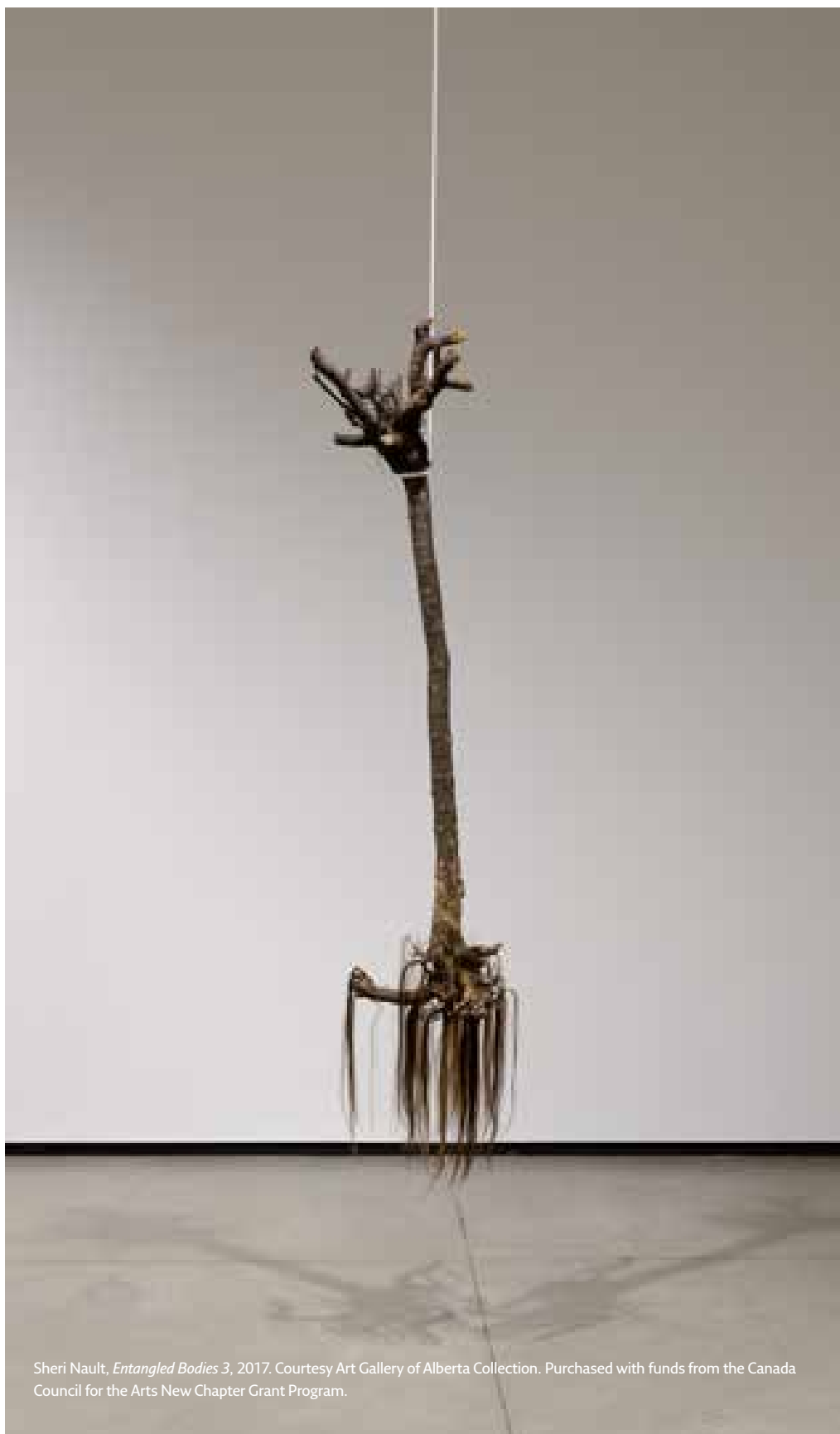
Sheri Nault, Entangled Bodies 3 , 2017. Courtesy Art Gallery of Alberta Collection. Purchased with funds from the Canada Council for the Arts New Chapter Grant Program.

*works recognized in the 2019 Audited Financial Statement