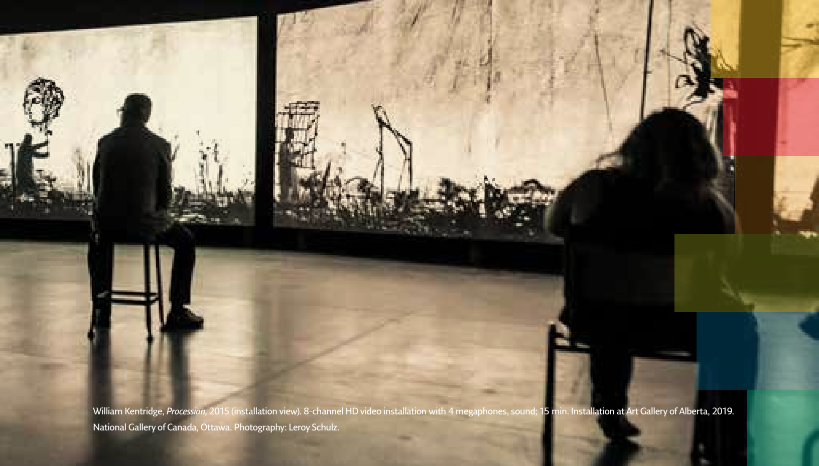
William Kentridge, Procession, 2015 (installation view). 8-channel HD video installation with 4 megaphones, sound; 15 min. Installation at Art Gallery of Alberta, 2019. National Gallery of Canada, Ottawa.