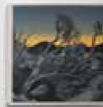
Installation view of Marigold Santos: SURFACE TETHER , Art Gallery of Alberta, Edmonton, 2019.