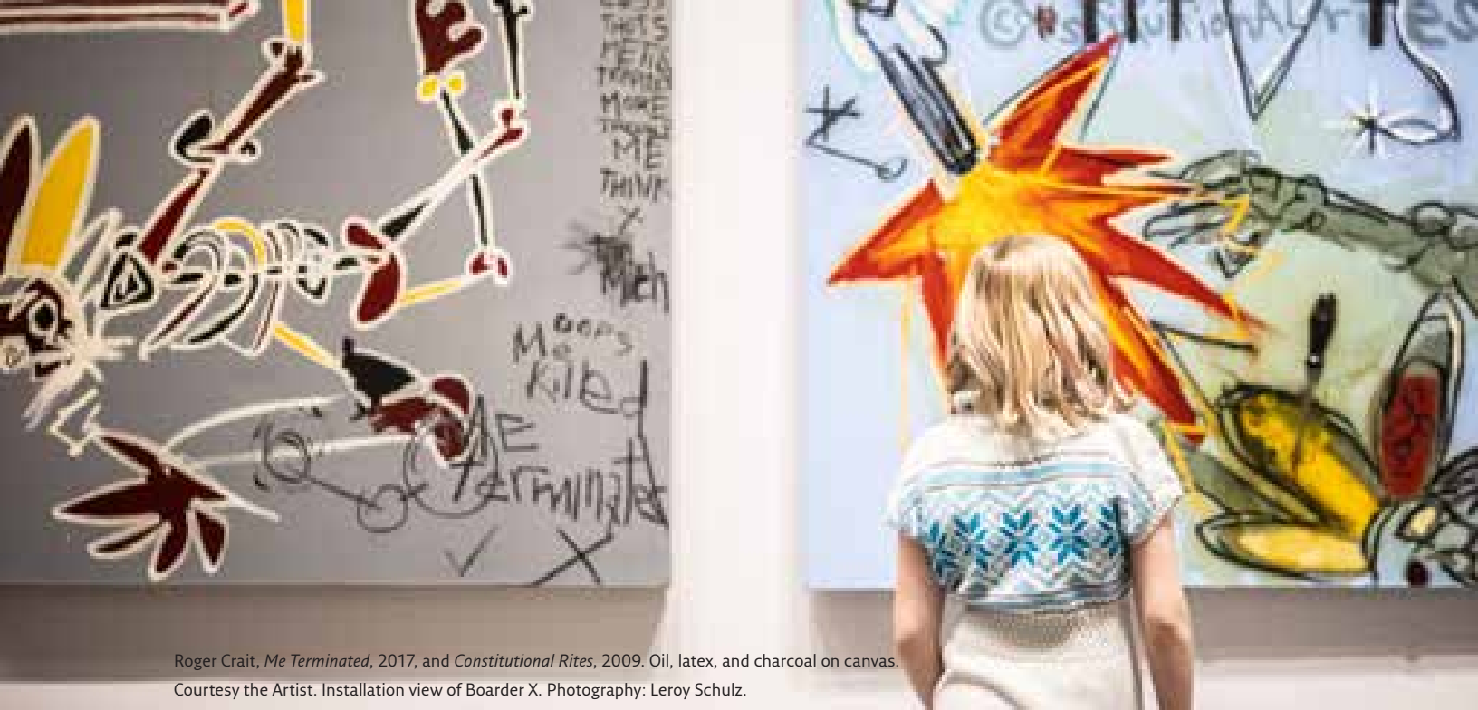
Roger Crait, Me Terminated , 2017, and Constitutional Rites , 2009. Oil, latex, and charcoal on canvas. Courtesy the Artist. Installation view of Boarder X.