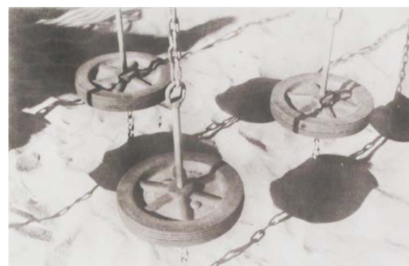
Candace Makowichuk Stepping Stones: The Playground is Closed Series , 2016 Bromoil photograph Collection of the artist