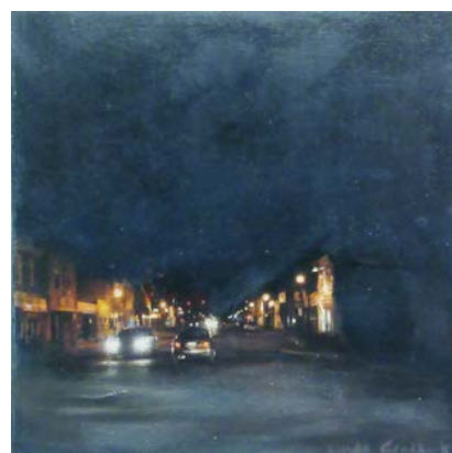
Linda Craddock Hometown Dreams: When the Sky became the Sea; Main Street, Headlights , 2012 Oil and photo collage on birch Private collection of the artist

The AGA TREX exhibition ...fire and frost explores memory; presenting the work of three contemporary artists who, through the lens of a camera or mixed media expressions, document past and present experiences, objects and places to capture time and awaken memories that are universal in nature. While these memories can be like fire - bold or burning with longing or regret - or like frost - giving pause for quiet reflection or chilling us to the bone, they fill us ...with a heart-aching wonder... and help us understand where we come from and inform our interactions both in the present and into the future.