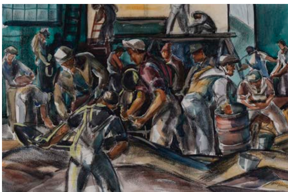
Bart Pragnell Untitled , 1946 Watercolour, charcoal on paper Collection of the Alberta Foundation for the Arts