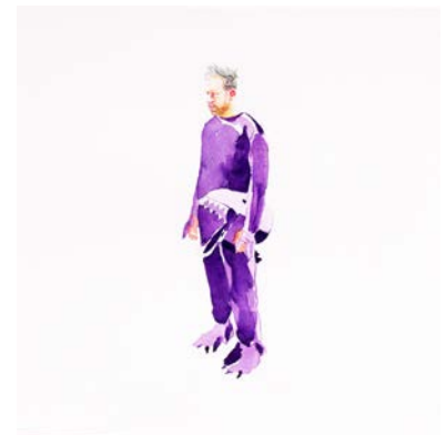
Julian Forrest Study (Purple Dinosaur II) , 2019 Watercolour on paper Collection of the artist