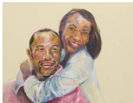
Fren Mah My Best Friend , 2020 Oil on canvas Collection of the artist

In feminist theory, the phrase 'the male gaze' refers to the act of depicting women in the visual arts and in literature from a masculine, heterosexual perspective that presents women as objects for the pleasure of the male viewer. The TREX exhibition The Male Gaze disrupts this practice by presenting the work of three male artists from Edmonton who portray men or masculine themes as subjects in their work. Examining stereotypes and changing social landscapes these artists ask the viewer to question and consider the character of men in society both through the lens of history and in the present day.