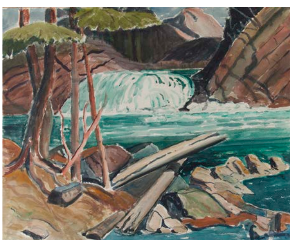
Ella Richards Untitled (Bow Falls) , 1950 Collection of the Alberta Foundation for the Arts TREX Exhibition: From Water into Sky