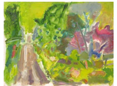
Les Graff Lake Road Study #3 , 2001 Collection of the Artist