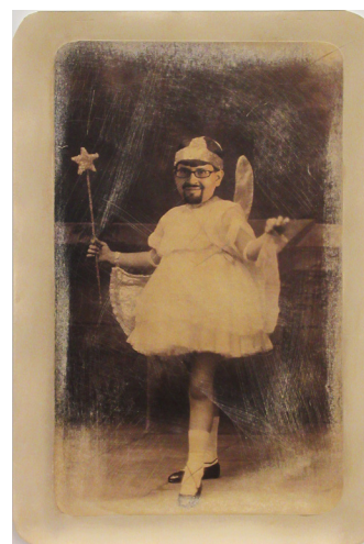
Darcy Logan When We Play We Grow Wiser, When We Judge We Grow Older , 2016 Collection of the Artist