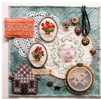
Diane Duncan Mom Evelyn , 2016 Collection of the Artist

Art is a language used to translate information from the artist to an audience that is difficult to transmit via the restrictions of language alone. It speaks of emotion, vision, sound and reaction to surroundings and often invokes much more than a verbal response from the audience. Art can incite joy or sorrow, appeal or revulsion, peace or anger, pleasure or pain and one could continue this list. Art is a window into the soul of the artist, providing a glimpse of past and current experiences, emotions, and interests.