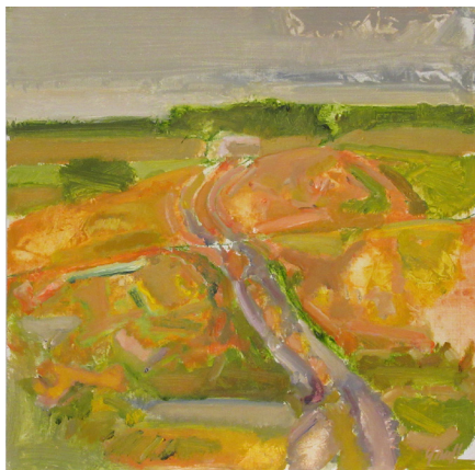
Les Graff Road Across Farmer's Field #2 , 2008 Oil on masonite Collection of the artist

The landscape of Alberta has been a popular subject for Alberta's artists since the late 1800s and for good reason. Majestic mountains; beautiful forests; rolling hills and prairies; an abundance of rivers and lakes: what's not to love?