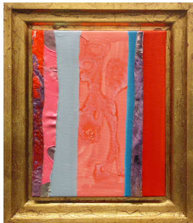
Graham Peacock Suite 111, #29, 2011 Painted canvas collage On loan from the artist

Graham Peacock has been a significant figure on both the Edmonton and International art scene since he moved to Edmonton in 1969. Over the decades he has developed unique ways of drawing with paint; manipulated the forms of his canvases; formulated his own paint mediums; spear-headed the formation of important art groups and assisted in fostering a climate favorable to abstraction in Edmonton. Through his teaching at the University of Alberta he has also shaped the artistic visions of countless students.