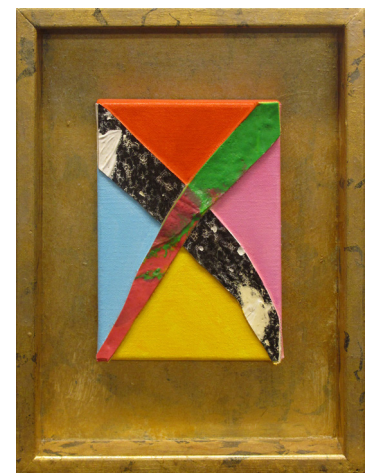
Graham Peacock Kris Cross Miniature #10, 2014 Painted canvas collage On loan from the artist

Graham Peacock's artistic career has been characterized by a sense of continual experimentation: a search for new ways to express his love of colour, form and the world around him. One modality he has been exploring since the 1980s is that of collage.